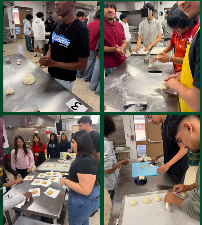
Tolleson Culinary Students